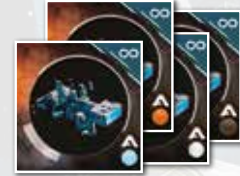
4 Base Activation Action tokens (1 per player)