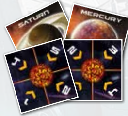
14 Kuiper tokens