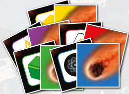
27 Asteroid tokens in 5 colors